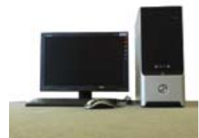
Uniform RIP Station

Add in our high quality ink set and our high quality build and you get a very stable printer that is easy to operate and very reliable.